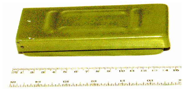
PMA – 1 PMA-2